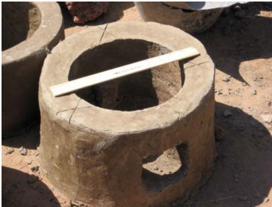
Figure 1: Standard CHF Stove

combustion air flow even when a tight-fitting large pot or a flat metal plate is being used for cooking. In the current ITDG design, either of these would otherwise throttle air exhaust and choke the fire. The newly improved stove, “Avi” was later tested by the ND team, and their impressions are reported in Section 2.2 and 3.3, below.