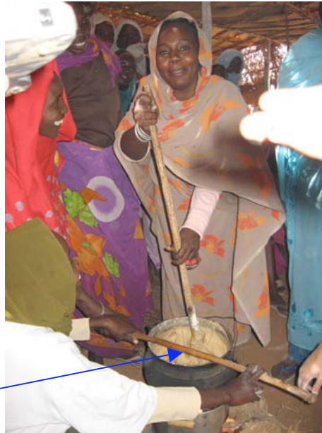
Figure 4: Vigorous stirring on the Tara currently requires too many cooks

Stabilizing the pot with a horizontal stick for stirring of the assida