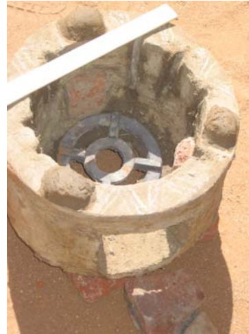
Figure 2: Improved “Avi” Stove

On Sunday Nov. 22, the SD team was invited to give a presentation of its preliminary findings to the UN Office of Coordination of Humanitarian Affairs (UN-OCHA) in Nyala. This presentation and discussion was attended by close to 25 representatives from various NGOs attended at the invitation of UN-OCHA. On November 29-30, the ND team joined the SD team in Nyala. At the markets, the full team explored local capacities in Nyala for producing the most appropriate FES, determined both by the IDPs to be the most suitable for their cooking conditions and by the availability of source materials for making the stove, as well as the logistical and organizational aspects of wide scale rapid stove dissemination in the IDP camps. The SD team left on November 30 for Khartoum.