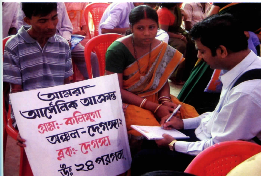
Lawrence Berkeley National Laboratory

The problem of arsenic poisoning in West Bengal and Bangladesh has been called the largest case of mass poisoning in the history of mankind. Two protesters are interviewed at a 2009 sit-in in West Bengal that demanded access to arsenic-safe water and medical treatment.